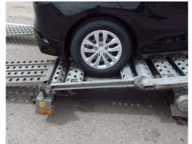
Crossbars set for crossing.